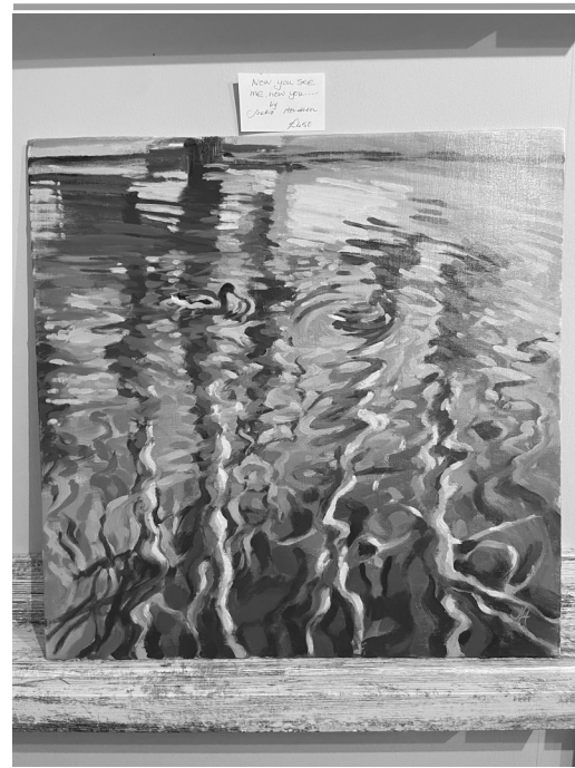
Now you see me, now you...